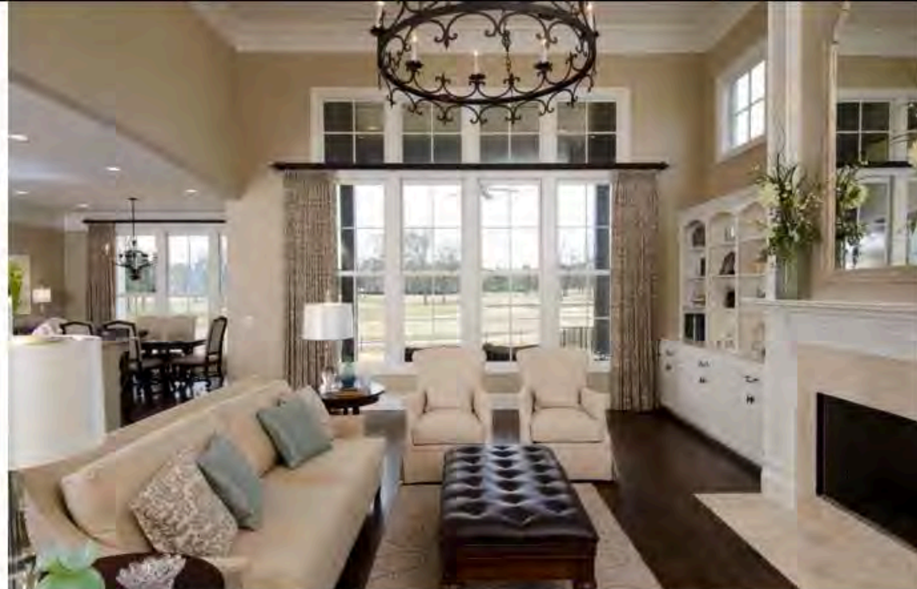
When Mathews Construction designed this home, we wanted to take advantage of the golf course and lake views as well as let in as much natural light as possible into the main living areas. To accommodate this and keep the home energy efficient, we utilized Low E windows and upgraded insulation.

One question that we hear out in the community is, "Should I purchase a new home or buy an existing home?" Almost every homebuyer contemplates this question early on in the house hunting process, and to make the right decision it requires