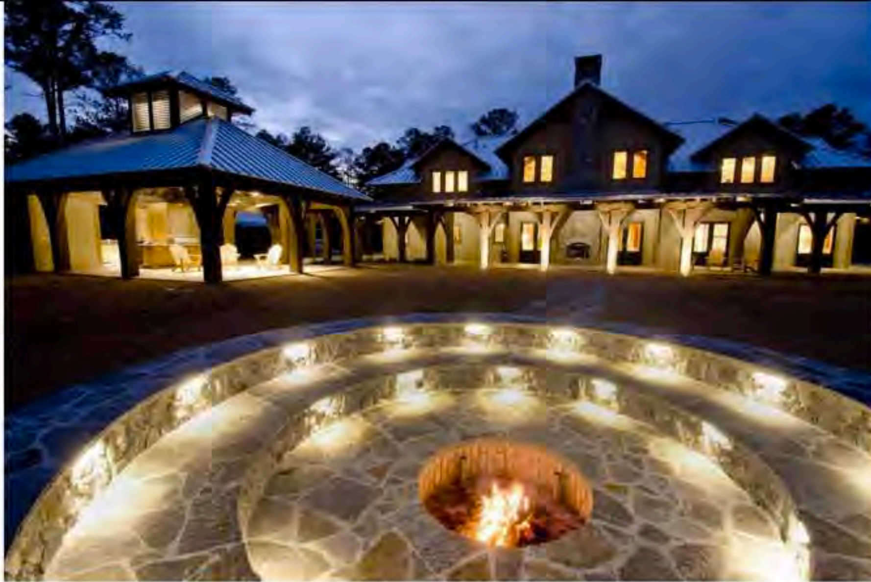
This home built by Mathews Construction shows outdoor living at its finest with a wrap around porch, firepit, and outdoor kitchen.

• Choosing a Home Plan & Design: Now, here comes the fun part! There are all different types of architectural styles and